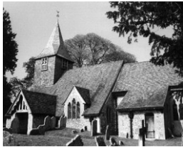
All Saints Church